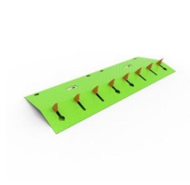
Steel Road Spikes Heavy Duty