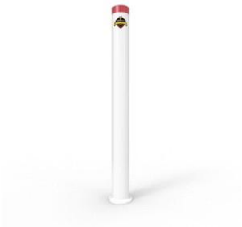
Storefront Crash Prevention Bollard