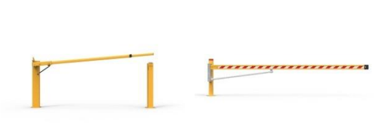
Telescopic Boom Gate

i We are currently compiling a list of additional services that might apply to this product.