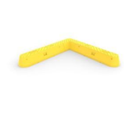
Menni Asset Protection System