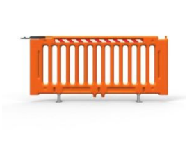
Post-Q Fixed Fence System

! We are currently compiling a list of additional services that might apply to this product.