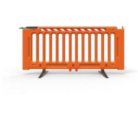
Crowd-Q Crowd Control Barrier