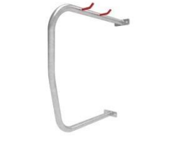
Bike Rack – Style 4 Galvanised Steel Wall Mounted

What are some effective skateboard deterrents or stops to protect public spaces and property?