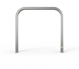
Bike Rail – Style 2 316 Stainless Steel