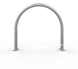
Bike Rail – Style 3 316 Stainless Steel