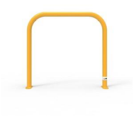
Bike Rail – Style 1 Galvanised Steel