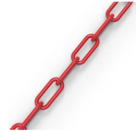
Plastic Safety Chains