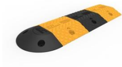
Rubber Speed Hump Medium Duty