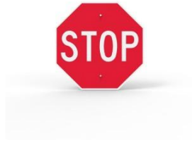
Car Park Signs