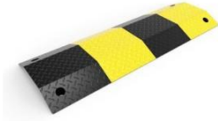
Steel Speed Hump - Standard Duty