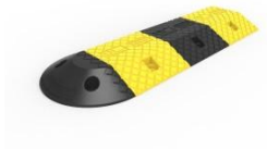
Polyethylene Speed Hump Heavy Duty