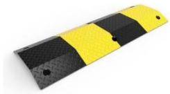
Steel Speed Hump - Heavy Duty